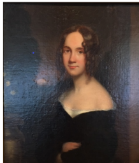
SARAH JOSEPHA HALE

On Saturday evening, October 5, Sarah Josepha Hale was inducted in to the New Hampshire Writers' Project Literary Hall of Fame along with Hale Winners Tomie dePaola and Maxine Kumin as well as Harriet E. Wilson, whose book was discovered by another Hale Winner, Henry Louis Gates.