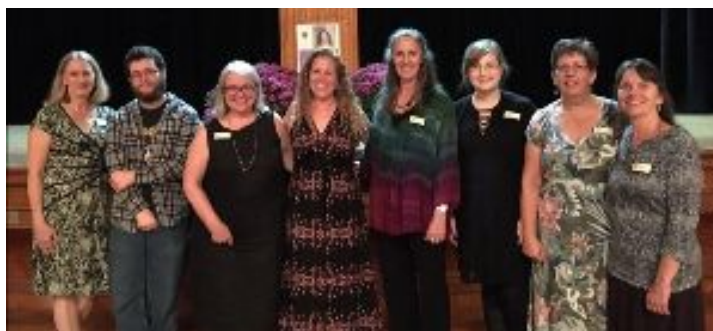
JODI PICOULT 2019 HALE AWARD WINNER

On Saturday evening, October 5, Sarah Josepha Hale was inducted in to the New Hampshire Writers' Project Literary Hall of Fame along with Hale Winners Tomie dePaola and Maxine Kumin as well as Harriet E. Wilson, whose book was discovered by another Hale Winner, Henry Louis Gates.