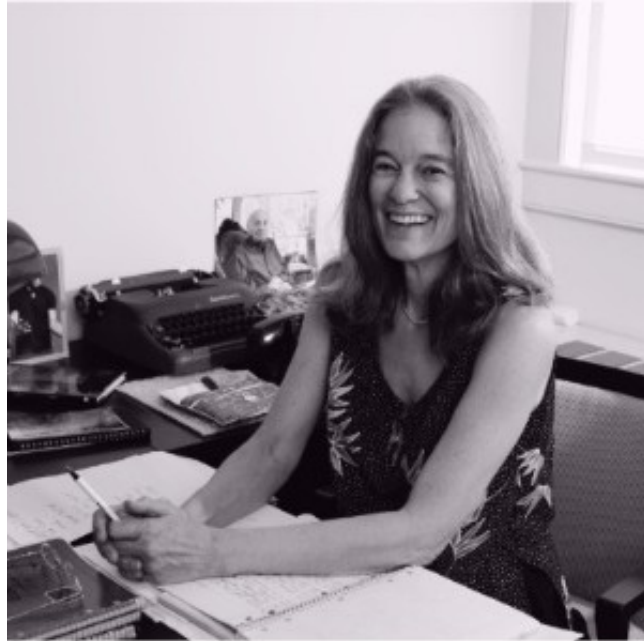
Sharon Olds